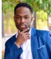
Public Relations Officer