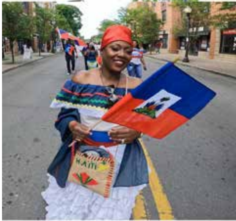
A large crowd turned out for the Haitian Flag Day Parade on Main Street and celebration at Memorial Park in Spring Valley May 16, 2024.