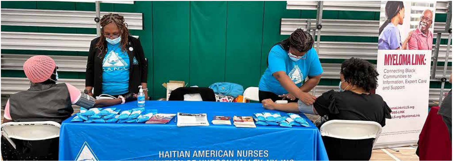
HAITIAN AMERICAN NURSES